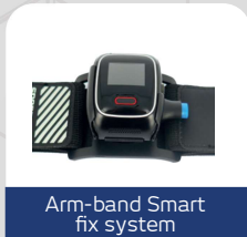
Arm-band Smart fix system