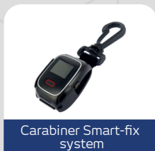
Carabiner Smart-fix system