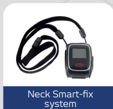
Neck Smart-fix system